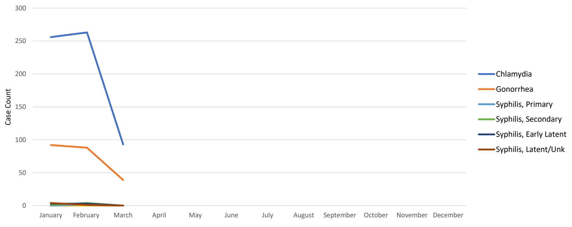
Sexually Transmitted Infections