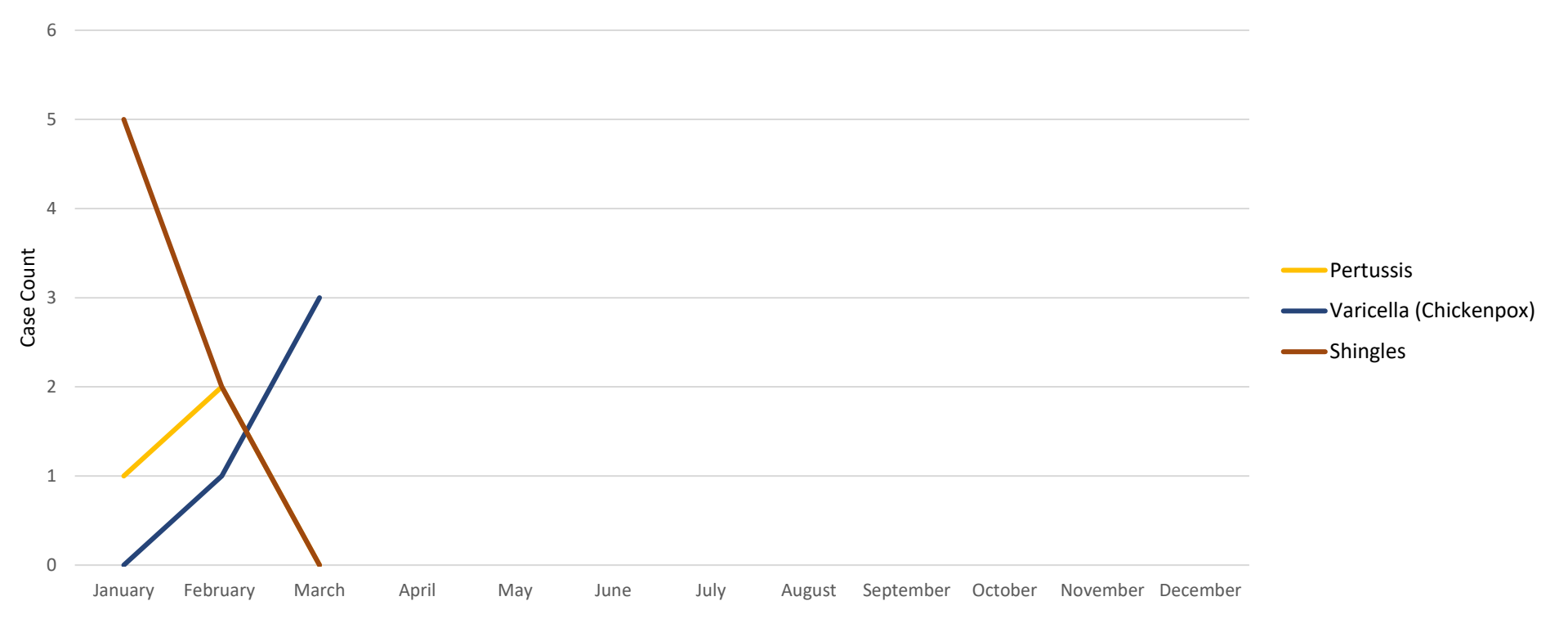
Vaccine Preventable Illnesses