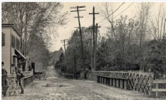
A picture of Providence Rd, aka Route 252 from 1897 during rush hour. You are standing at Possum Hollow Rd, looking north toward Media. The house on the left is still standing and the bridge is over the West Chester R.R. local line.

Delaware County Township Names and history events in the area for Black History Month etc.