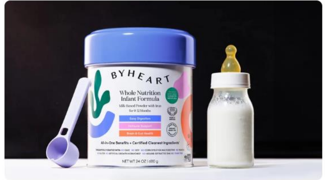
Image (c) ConsumerAffairs. A major recall of ByHeart formula linked to 37 infant botulism cases prompts health warnings and prevention tips for parents.

Federal health officials are urging families to check their pantries after 37 U.S. infants were diagnosed with infant botulism linked to ByHeart-brand powdered infant formula—an outbreak that has rapidly become one of the largest recorded in the United States. While all known cases remain domestic, the formula was shipped to 21 other countries, and public health authorities say it is still unclear whether infants overseas have also been affected.