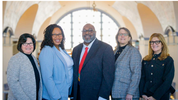
Delaware County Council members