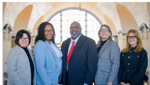
Delaware County Council members

Delaware County Libraries will be celebrating summer reading throughout the summer with a variety of programs and events. Each of the 28 local libraries will have Summer Reading Kick-off Programs, there will be a challenge for young readers to visit as many libraries across Delco as possible, Beanstack will provide online reading challenges, libraries will partner with the Franklin Institute and GSK for science programs, and much more! For more information, visit delcolibraries.org/summer-quest .